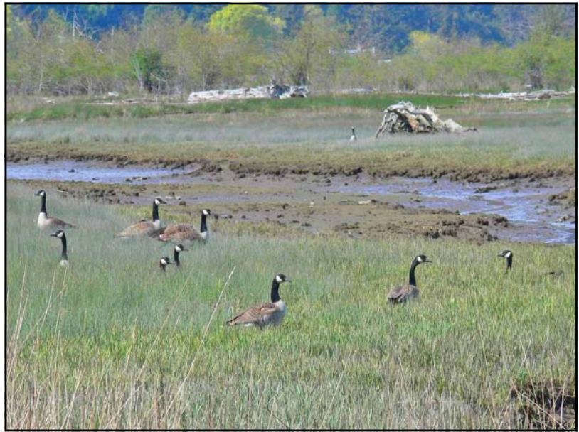
Resident Canada Geese feeding in the Carex -channel edge community of the Little Qualicum River estuary, 23 April 2007. Evidence of their grubbing activities in the form of mud clumps and an eroded channel edge can be seen in the channel behind the geese.

R ecently, myself, Sean Boyd, Ron Buechert and Andy Stewart studied the impacts resident geese were causing to the Little Qualicum River estuary. Of major concern were the impacts to a keystone species, a sedge called Carex lyngbyei . This sedge contributes significant biomass to the detrital food web of the estuary, which feeds a wide variety of invertebrates that, in turn, support the higher trophic levels, including salmonids and waterbirds.