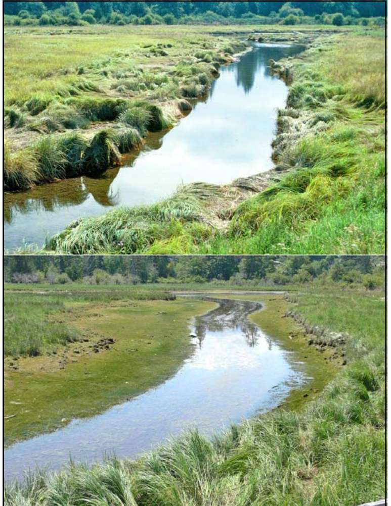
North dendritic channel of the Little Qualicum River estuarine marsh, 29 August 1980 (top) and 26 June 2009 (bottom). The tall form of Carex lyngbyei , growing directly adjacent to the channel, has been eliminated from much of the Carex -channel edge community by resident Canada Geese. Note the substrate erosion that has also occurred, a result of goose grubbing activities.

To do nothing, however, would result in continued growth of the resident Canada Goose population and the continued decline of many of these once productive estuarine systems on Vancouver Island.